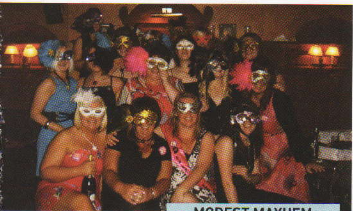
MODEST MAYHEM £££££