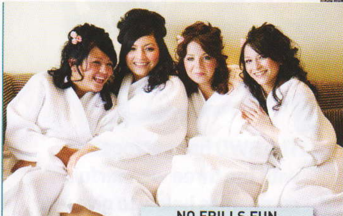
NO FRILLS FUN ££££